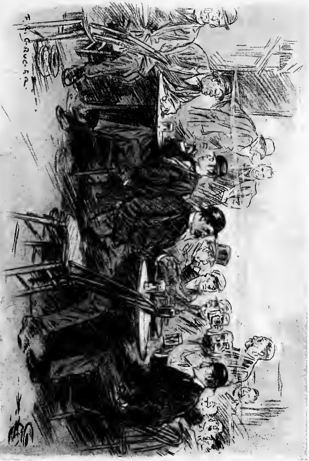
“TALK TO ME. TELL STORIES. LAUGH. DO ANYTHING.”